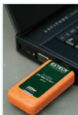
BRD10 - Optional Wireless USB Video Receiver allows user to stream live video to a PC and also can be remotely viewed via VOIP connection