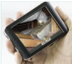
Detachable wireless 3.5" color TFT LCD display can be viewed from a remote location up to 32ft (10m) from the measurement point.

Complete with 4 AA batteries, rechargeable display battery, microSD memory card with SD adaptor, USB cable, extension tools (mirror, hook, magnet) video interconnect cable, AC adaptor (100-240V, 50/60Hz), magnetic base stand, and hard case